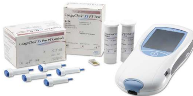
CoaguChek XS Pro PT Test Strip package insert, 05967716001(02), 2010.